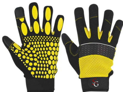
7 8 9 10 11 CECat.II