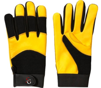
7 8 9 10 11 CCEat.II