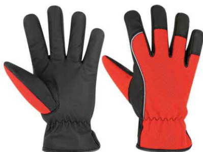
7 8 9 10 11 CECat.II