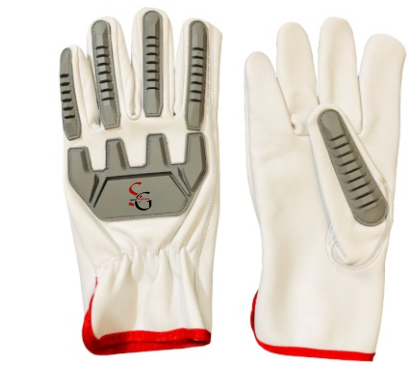
7 8 9 10 11 CCat.II