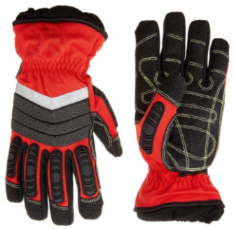
7 8 9 10 11 CCat.II