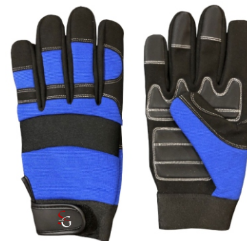
7 8 9 10 11 CECat.II