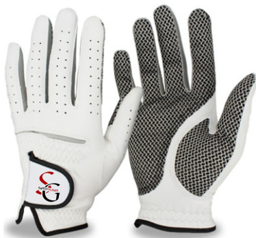
7 8 9 10 11 CCat.II