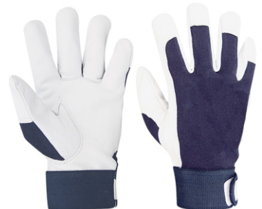
7 8 9 10 11 CCat.II

Packing: Poly Bag 12 Pair In Carton 120 Pair