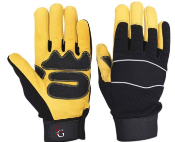
7 8 9 10 11 CCEat.II