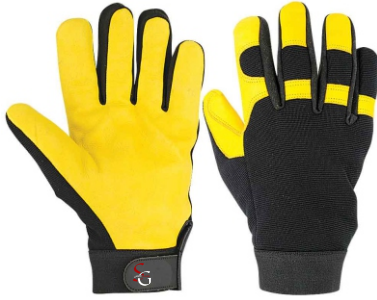
7 8 9 10 11 CCEat.II