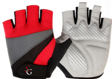
7 8 9 10 11 CCat.II