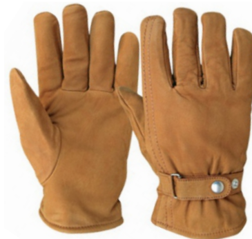
7 8 9 10 11 CCat.II