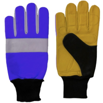
7 8 9 10 11 CCat.II