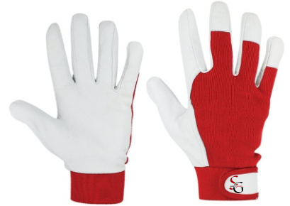
7 8 9 10 11 CCat.II

Packing: Poly Bag 12 Pair In Carton 120 Pair