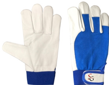
7 8 9 10 11 CCat.II

Packing: Poly Bag 12 Pair In Carton 120 Pair