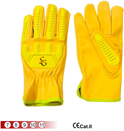
7 8 9 10 11 CCat.II