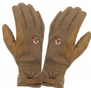
7 8 9 10 11 CCat.II