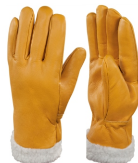
7 8 9 10 11 CCat.II