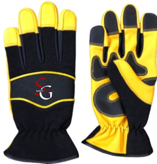
7 8 9 10 11 CCEat.II