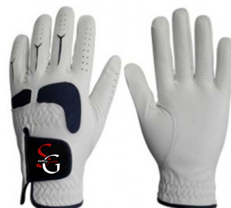
7 8 9 10 11 CCat.II