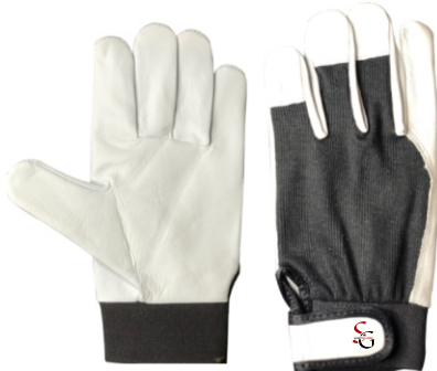
7 8 9 10 11 CCat.II

Packing: Poly Bag 12 Pair In Carton 120 Pair