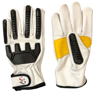
7 8 9 10 11 CCat.II