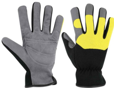
7 8 9 10 11 CCEat.II