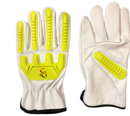
7 8 9 10 11 CCat.II