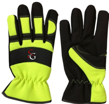
7 8 9 10 11 CECat.II