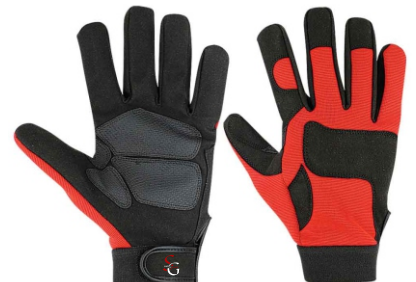
7 8 9 10 11 CCEat.II