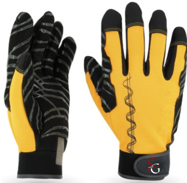
7 8 9 10 11 CCat.II