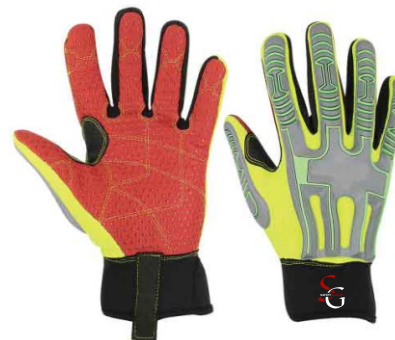
7 8 9 10 11 CECat.II