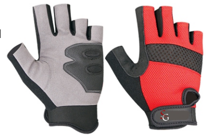
7 8 9 10 11 CCat.II