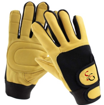
7 8 9 10 11 CCat.II