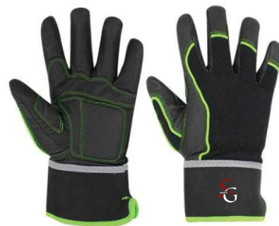
7 8 9 10 11 CECat.II