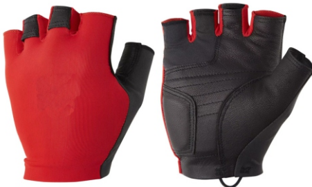
7 8 9 10 11 CCat.II